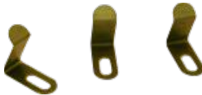
Contact Plate Springs

Replacement springs used to hold 55 mm contact plates. 3 per pack.