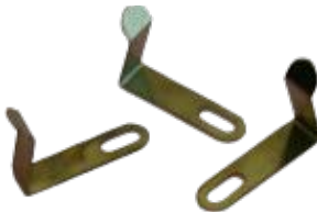
MicroBio Petri Dish Springs

Replacement springs used to hold 90 mm Petri dish plates. 3 per pack.