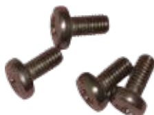
MicroBio Head Screws

Replacement stainless steel M3 x 6 screws used to fasten the dish, plate and head retaining springs. Sold in a pack of 10.